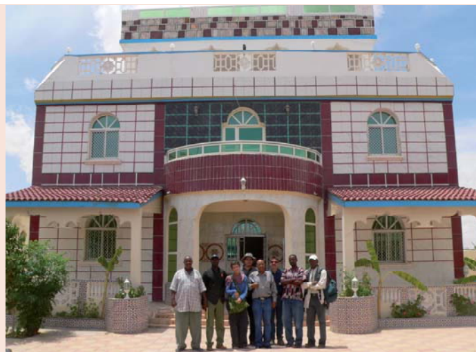
New FAO Somaliland support office at Hargeisa. SWALIM liaison office will be housed here.

Functionally, the liaison offices will provide a platform for Somalia clients to request and access water and land information. To facilitate information access, the liaison offices will host an archive of water and land information products, served through a digital catalogue and a reference library. The reference library will mainly hold key water and land reference documents such as reports of pre-war studies and FAO water and land documents.